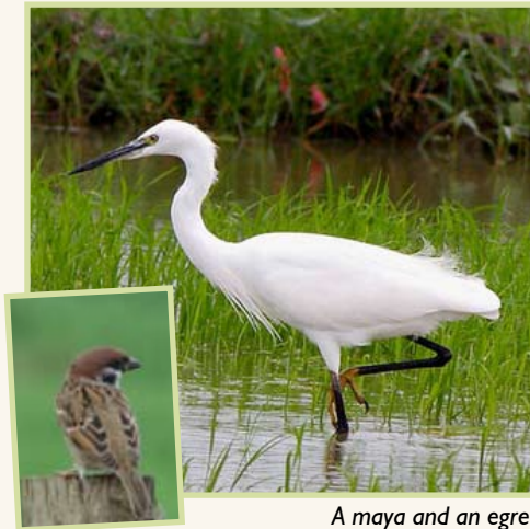
A maya and an egret.

No part of this brochure may be reproduced without written permission from the WBCP.